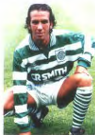
Paolo di Canio Page 8