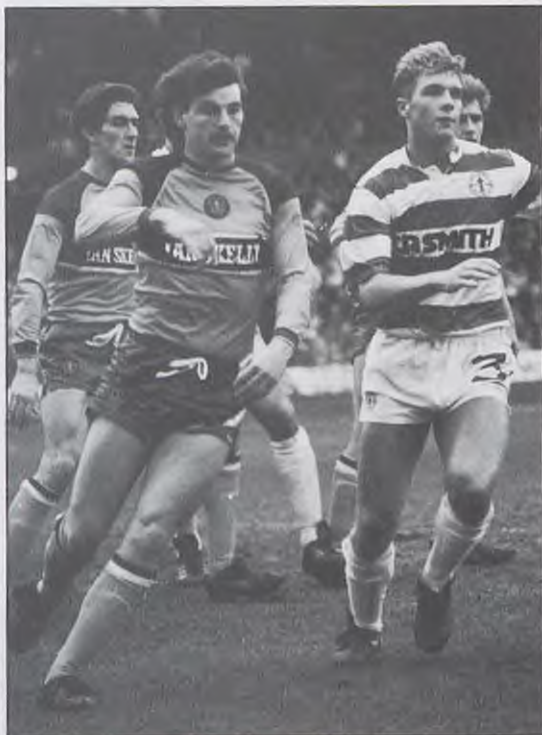
Action from a previous game against Celtic.

This enterprising attacking full-back will play his 80th consecutive game for Celtic today. He quickly established himself as a firm favourite with the Celtic faithful and he is a regular with the Eire National team. He had a hard act to follow because Danny McGrain was an institution as far as most Celtic supporters were concerned but Chris Morris has done the impossible and filled the gap left by Danny McGrain.