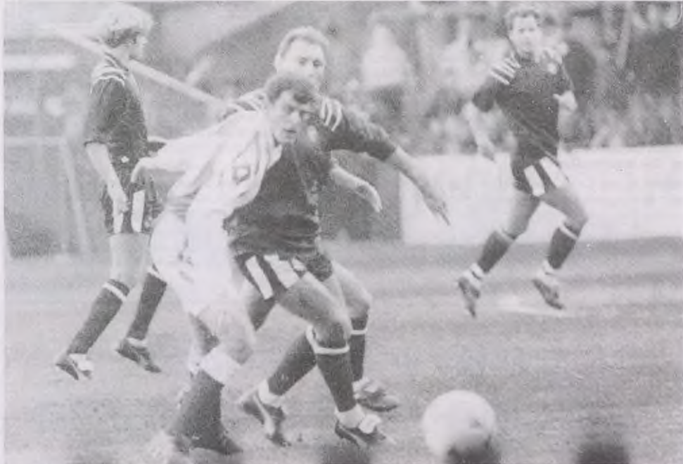
Darren Jackson who was on target for the third time against us this season.

Gordon Wallace was quickly installed as a replacement for Paul Sturrock as first team coach.