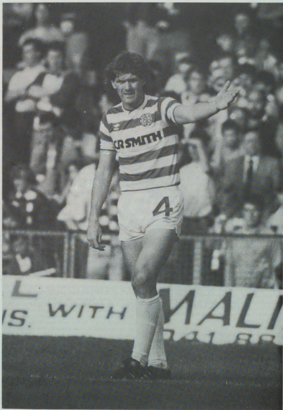
Celtic and Scotland powerhouse Roy Aitken.