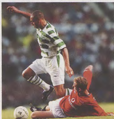
FRIENDLY FIRE: Last year's pre-season clash with Man United set Celtic up for a successful season

However, these games tend to be all about fitness and preparation rather than results and last season we all saw the benefit of playing