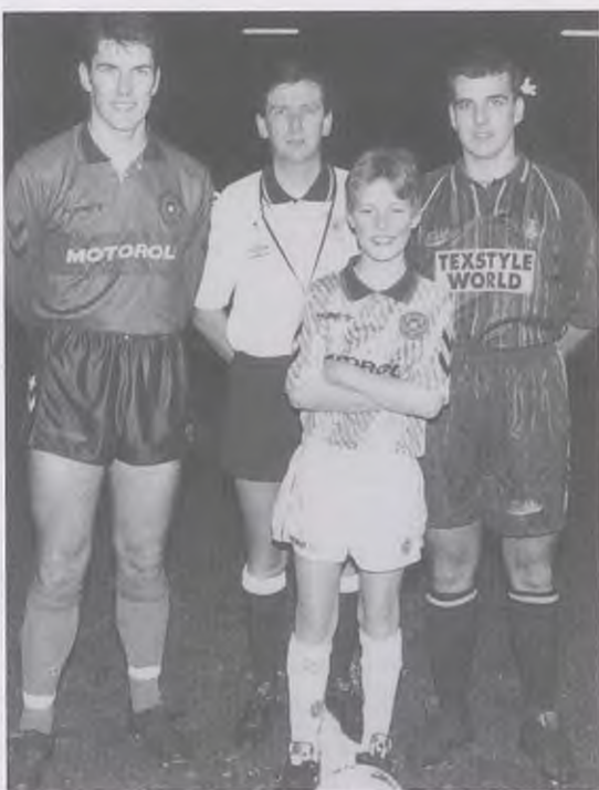
The referee, captains and mascots before the match with Partick Thistle.