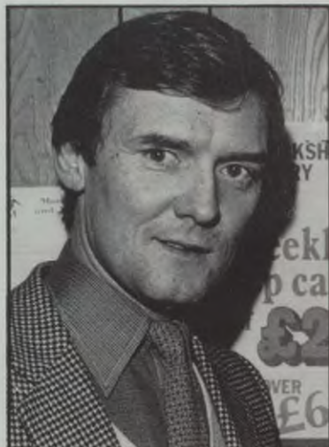
MANAGER DAVID HAY

Danny McGrain, now in his 37th year, is back in the side after a spell in the reserves. It just