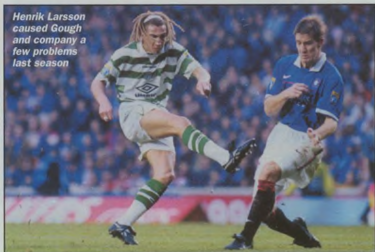
Henrik Larsson caused Gough and company a few problems last season

Ibrox side now prefer to play the ball on deck rather than putting high balls into the box.