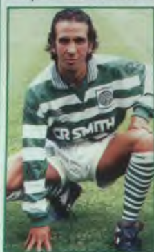
Paolo Di Canio

This, though, ignores the momentum that is currently being built up. When Celtic beat Hibernian 4-1 on January 18, it gave them a record of eight victories in nine league matches. Despite the defeats it has suffered,