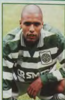
Pierre Van Hooijdonk