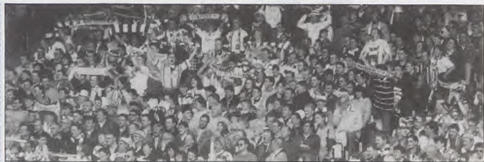
"Didn't we have a lovely time - the day we went to Hampden". A section of the Killie support last Sunday.