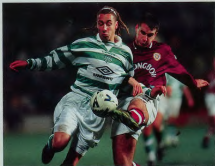
Paul Ritchie v Henrik Larsson last time round

However, after careful assessment, the Celtic Coach moved into the transfer market to acquire Vidar Riseth, Lubomir Moravcik, Johan Mjallby and Mark Viduka, and this clearly lifted the strength