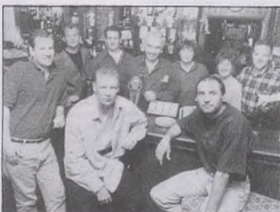
AULD HOOSE WALLACE KING (Lic), STAFF & CUSTOMERS