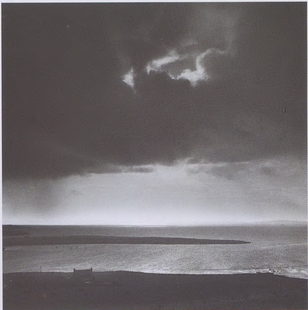
Orkney caught in a single moment by Don McCullin .