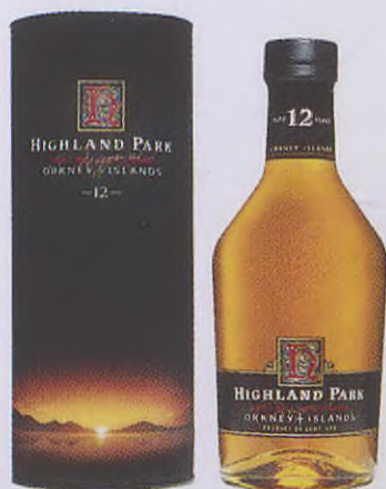
Orkney caught in a single malt by Highland Park .