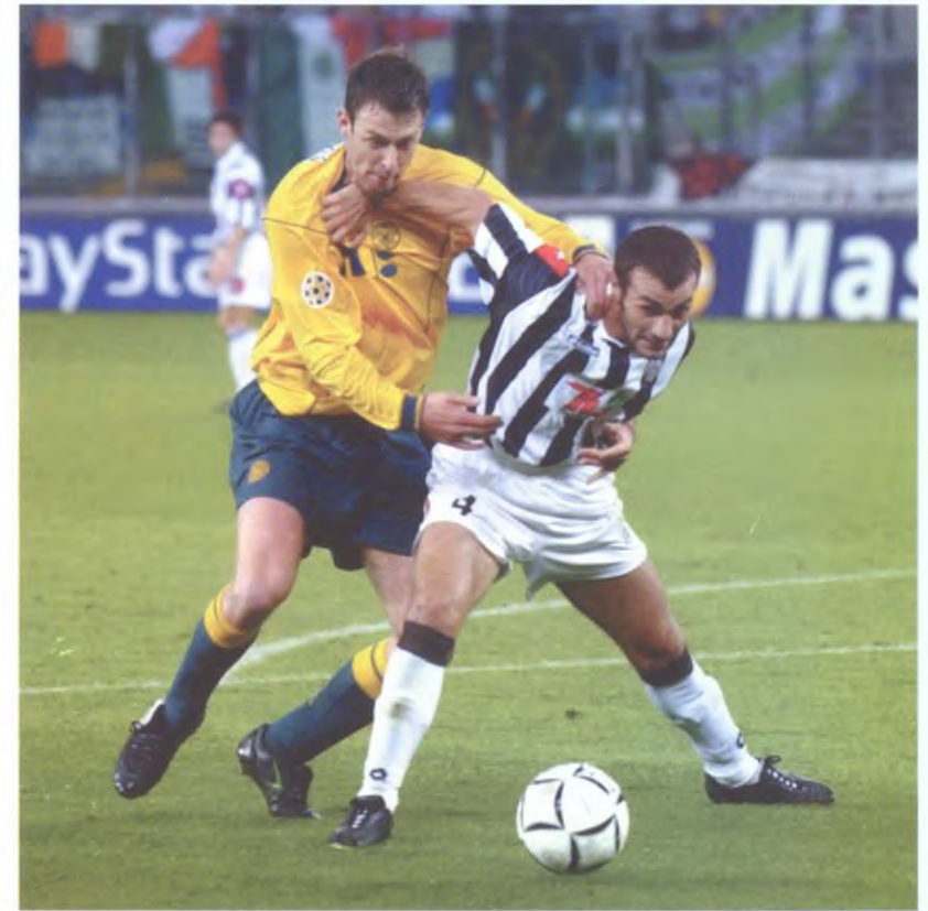
SEVEN FROM HEAVEN Henrik Larsson celebrates his penalty which levelled the match for Celtic (above), Chris Sutton's at the heart of the action (above right) and Stilian Petrov cracks a free kick home for the Bhoys' opener