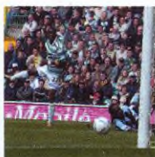
Goal 1 Henri Camara (1st) Vs Dundee text: CELT1