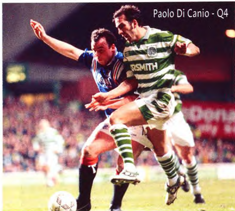
Paolo Di Canio - Q4

player to be awarded the Scottish Football Writers Player of the Year award?