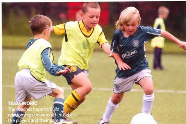
TEAM-WORK: The coaches hope to build relationships between themselves, the players and their parents

The reason for this is that they receive so little assistance from outside of their own club's coffers. In England over 70 football league and Premiership clubs received grants of £69,000 per year for four years for their youth programmes. Part of the deal was that the FA Premier League