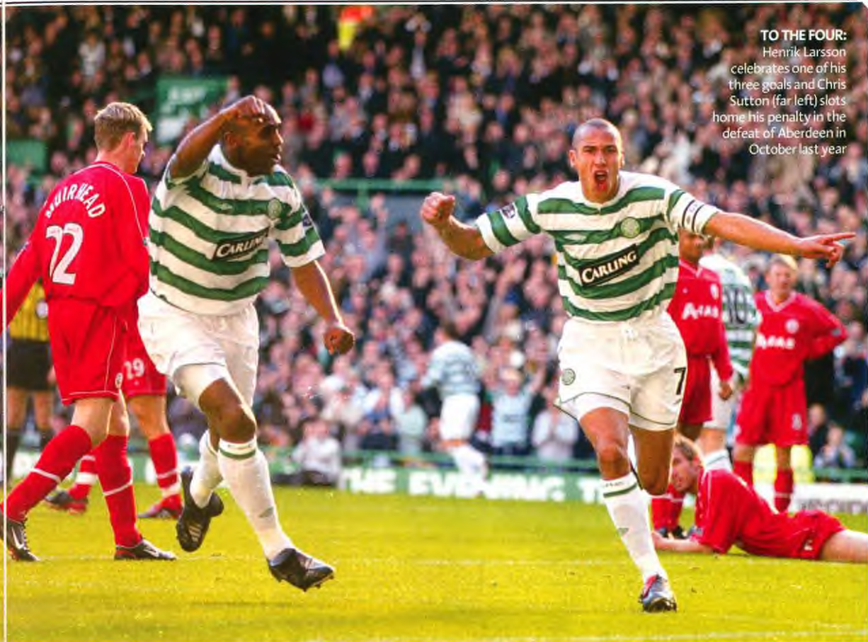
TO THE FOUR: Henrik Larsson celebrates one of his three goals and Chris Sutton (far left) slots home his penalty in the defeat of Aberdeen in October last year

Aberdeen during his time at Celtic Park.