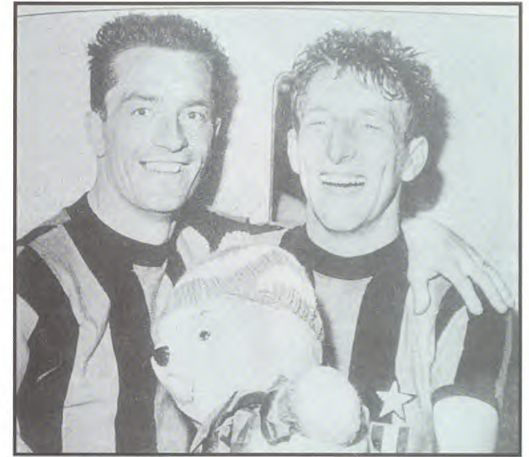
COUPLE OF CRACKERS... Tommy Gemmell and Stevie Chalmers celebrate Celtic's 1967 European Cup success. Gemmell was the hammer of FC Zurich earlier in the competition

Home fans at Celtic Park tonight can only hope that their revival does not extend to taking them into the last 16 of the UEFA Cup.