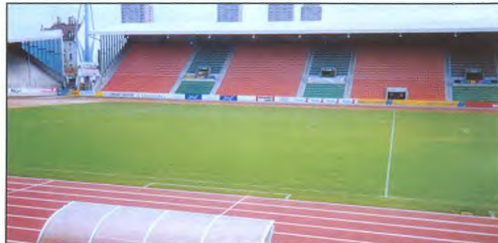
HOME COMFORTS... FC Zurich's Stadium Letzigrund