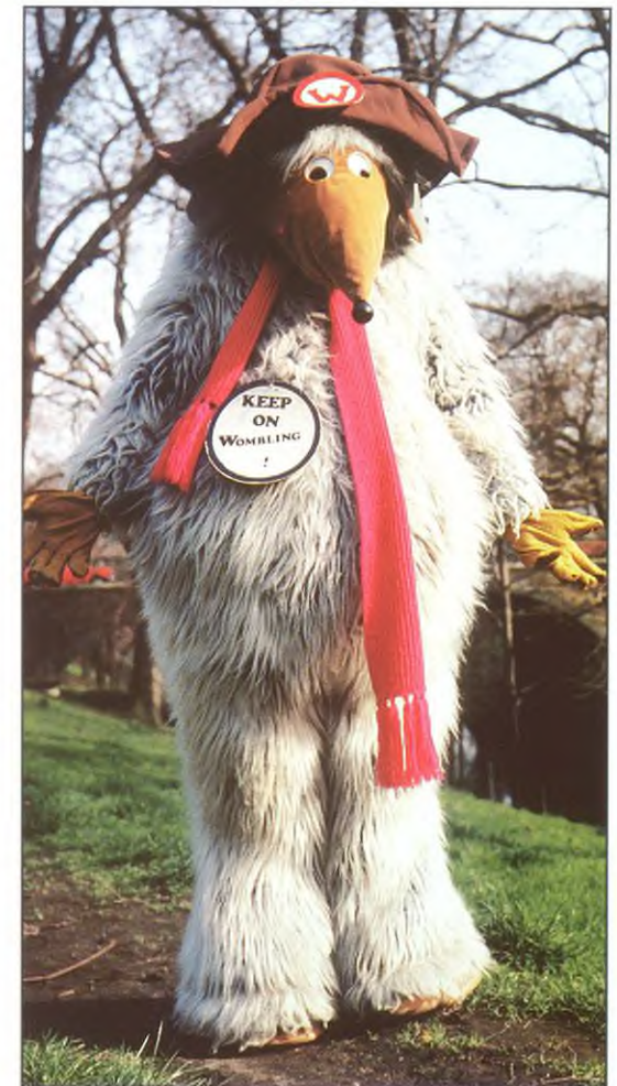
Terry's most disliked song was sung by Wombles!