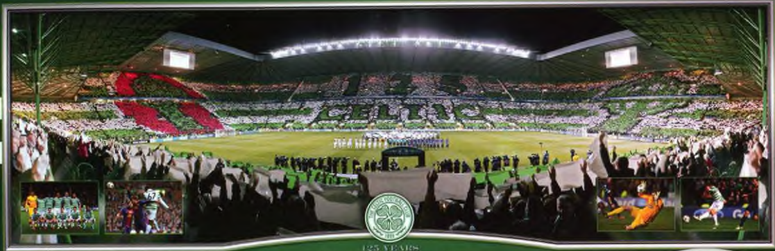
125 YEARS Celtic FC 2 v 1 FC Barcelona Celtic Park 7th November 2012