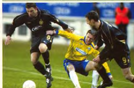
UEFA Cup 3rd Round, 2nd Leg, March 3 2004 FK TEPLICE 1 v CELTIC 3 (Celtic go through 3-1 on agg)

Scottish Premierleague, January 31, 2004 CELTIC 5 v 1 LIVINGSTON (Pearson, Larsson, Thompson 2, Sutton)