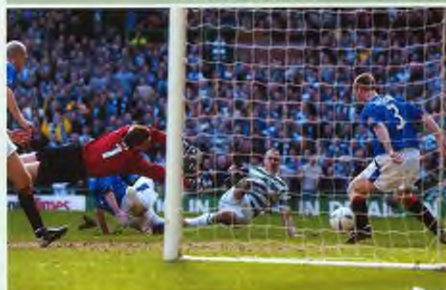
Scottish Cup 1/4 Final, March 7, 2004 CELTIC 1 v 0 RANGERS (Larsson)