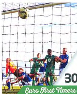
30 Euro First Timers