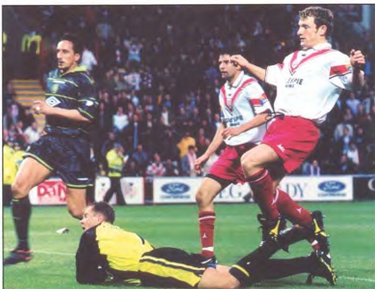
DOUBLE DIAMOND... Airdrie aim to end Celtic's cup run for the second time this season