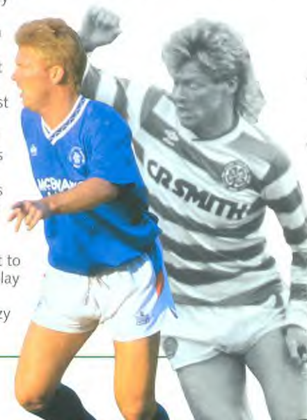
THISTLE NEVER DO... If only Mo's other Glasgow side could make it into Europe

He's not the first to be elevated to genius status without cause. I think you can guess which famous 'genius' I refer to. Yep! You've got it! I don't think Einstein ever even played the game!