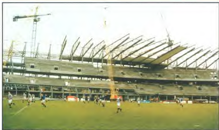
FINAL COUNTDOWN...The revamped Hampden opens in May

The national team is 37th in the FIFA rankings, our most expensively