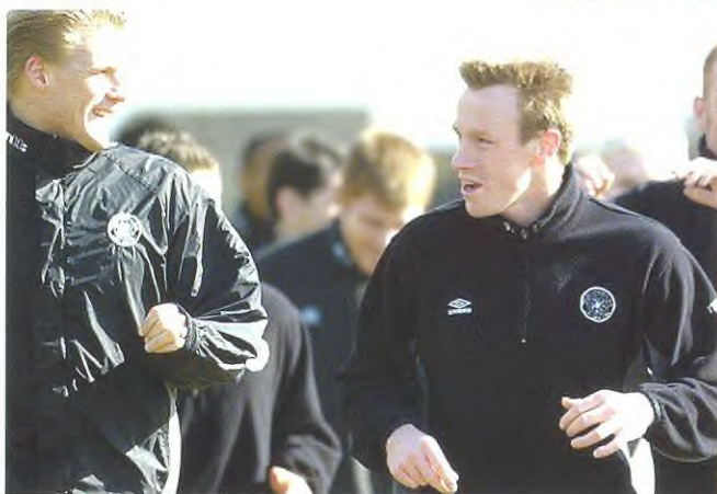
TALK TIME Valgaeren reckons his Celtic buddy scored a great goal against the Fir Park side last season but the ref thought otherwise

He said: "The first time I played at Celtic Park was against Motherwell on the second day of the season. It was a difficult game for us and we had two players sent off. I thought that it