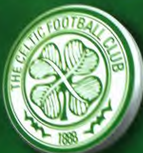
Celtic Football Club, Celtic Park, Glasgow, G40 3RE