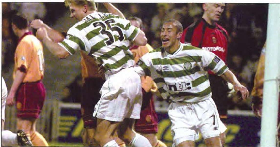
FIRST BLOOD: Henrik Larsson congratulates Johan Mjallby on Celts' opener in the 3-3 draw at Fir Park