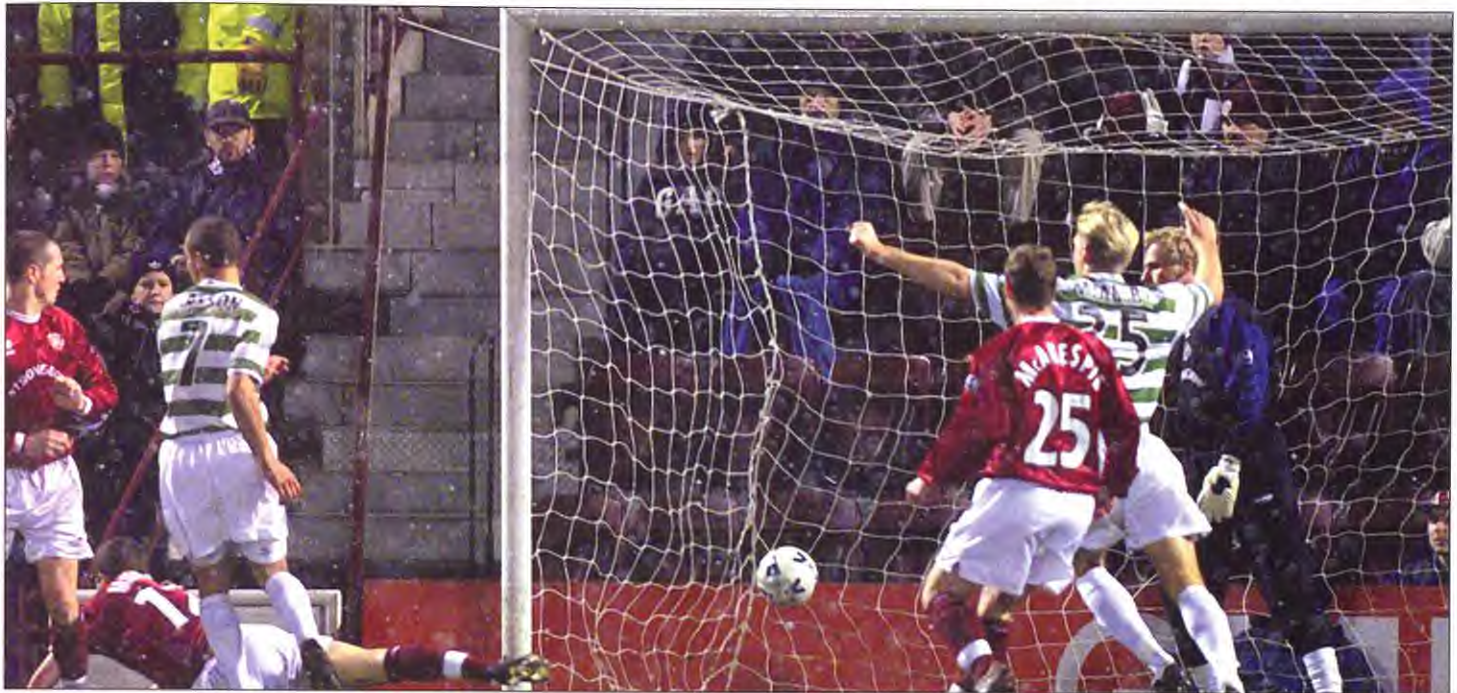
CAPITAL PUNISHMENT: Henrik Larsson hits the first goal of his stunning Tynecastle hat-trick and I was pleased he shared the credit

IT seems a long time since we last had the pleasure of playing in front of you all at Celtic Park but we certainly could not have picked a more spectacular occasion for our 'homecoming'.