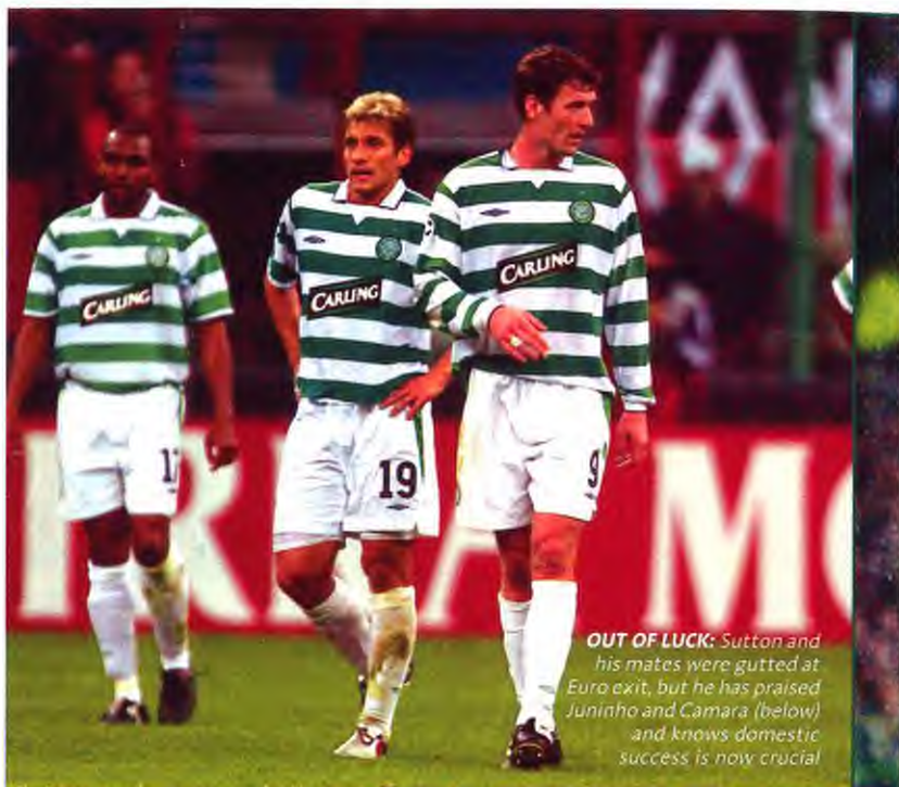
OUT OF LUCK: Sutton and his mates were gutted at Euro exit, but he has praised Juninho and Camara (below) and knows domestic success is now crucial

"We had a good realistic chance to get into the UEFA Cup, so that's been a disappointment but, having said that, in previous years we have