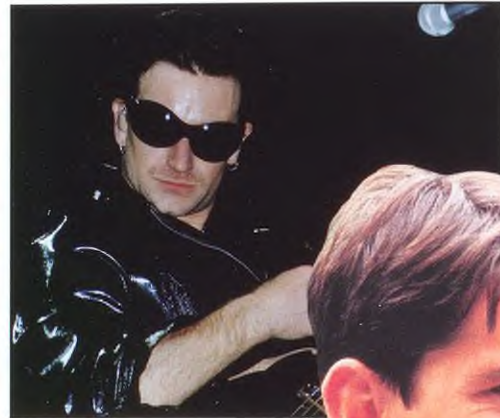
ON SONG... Travis' Why Does It Always Rain On Me and The Man Who CDs come out top on the Hoops star's list of favourite sounds while Bono (right) is his number one songster