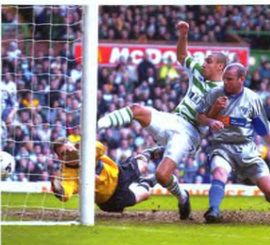
SWEDEN DREAMS: Henrik Larsson scores against Dunfermline last season

Today's visit of Dunfermline is a game that we have been focussed on since we started our pre-season preparations a month ago and, like me, I'm sure you're