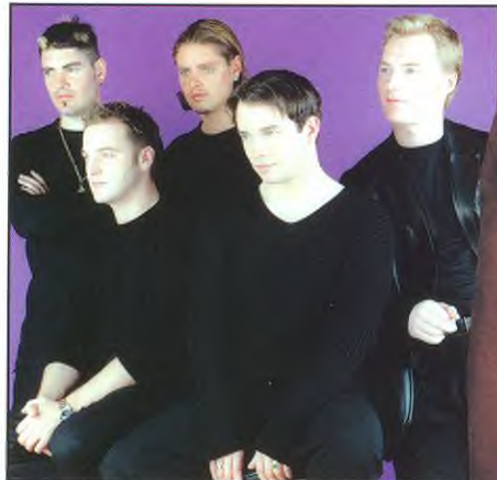
MUSIC TO HIS EARS... Madonna and Boyzone might not be everyone's cup of tea...