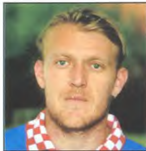
PROSINECKI: Midfield maestro

When placed in a social context, Croatians regarded Prosinecki's return home as a huge coup. After the sunny glamour of Spain, it took a bold bid to persuade a player at the height of his powers at just 28 to return home to a country riven by the strife of a civil war. France 98 was his third World Cup.