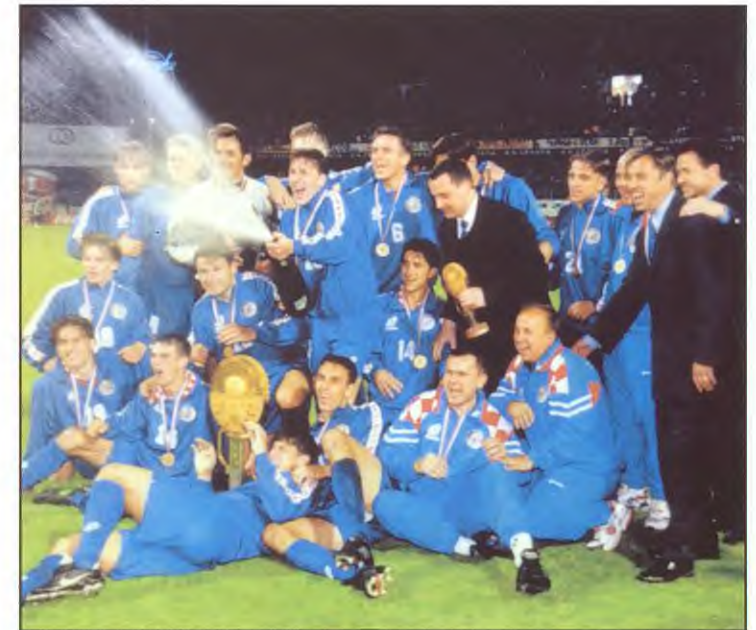
SMASH'N'GREB... celebrating last year's league title triumph

The Zagreb born defender was moulded in the highly successful FC Croatia youth team and can play full-back or centre-back, often in a man-marking role. Apparently very popular with the