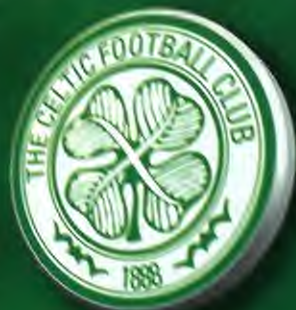
Celtic Football Club, Celtic Park, Glasgow, G40 3RE

A place in the last four of the first domestic cup competition of the season is the carrot dangling in front of us this evening.