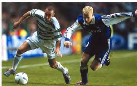
UEFA Champions League, November 5, 2003 CELTIC 3 v 1 ANDERLECHT