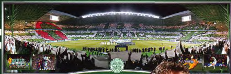
125 YEARS Celtic FC 2 v FC Barcelona 7th November 2012