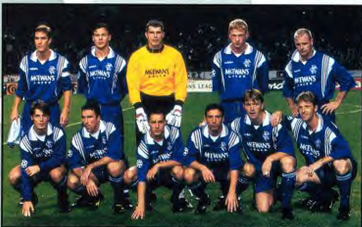
The Rangers team group pictured before a European clash

The 2-0 triumph Tommy Burns' men achieved in an emotional evening at Celtic Park a week past on Thursday marked the first reverse suffered by Rangers in an Old Firm clash in nine derby meetings - a period stretching back 22 months.