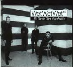
WetWetWet 10 If I Never See You Again

If I Never See You Again - The Single. OUT NOW. CD, Cassette, Limited Edition CD with 4 postcards