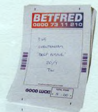
The bonus king

A big thank you to all our sponsors for their continued support