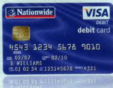
Proud to be different