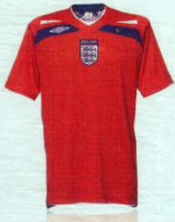
Bring it on