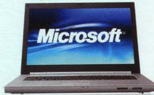
Your potential. Our passion®