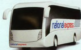
Making travel simpler