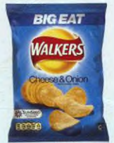
100% British potatoes