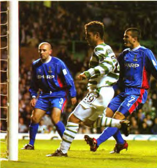
Celtic v Inverness Caledonian Thistle – Shaun Maloney's goal