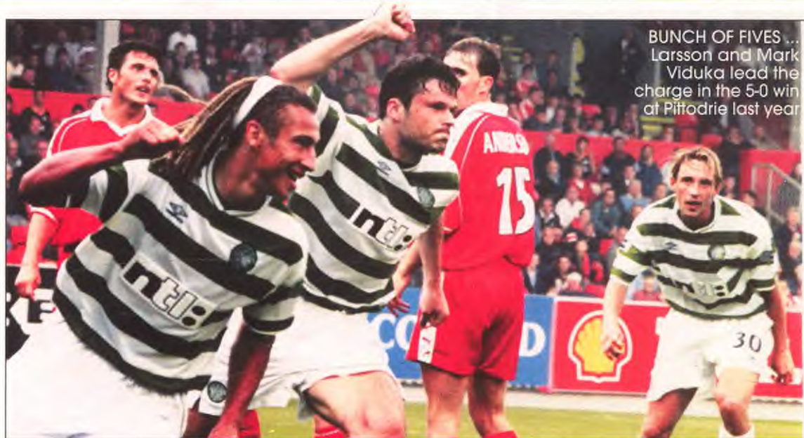
BUNCH OF FIVES ... Larsson and Mark Viduka lead the charge in the 5-0 win at Pittodrie last year