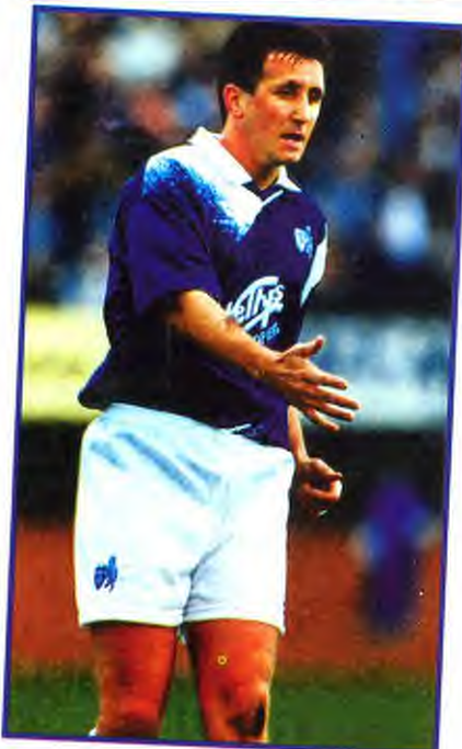
COYLE ... Twin in parliament?