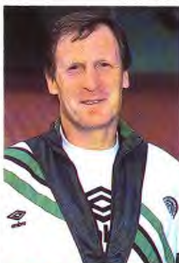
THE BOSS SPEAKS OUT

I hope that we will have contributed to it by earning a place in Europe next term.