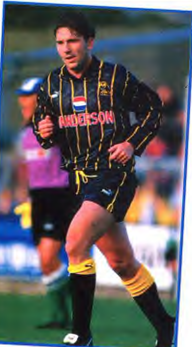
HIRST...£5million price tag