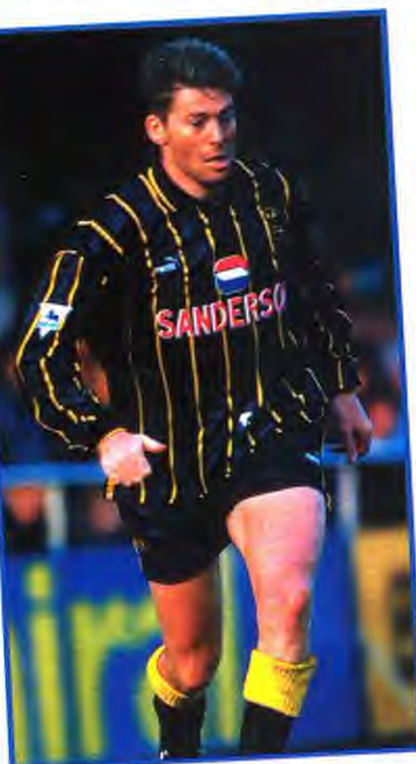
WADDLE... veteran ball wizard