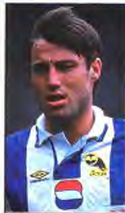
WARHURST... goal machine

for Exeter before his performances clinched a move to Torquay United in July 1986.