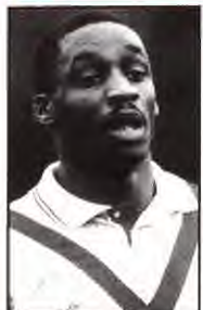
CAESER ... Jet-setter