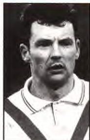
BLACK ... PC Plod feet

the world. The two of us went shopping together a couple of weeks back and the rest of the lads wondered what it would be like to see TWO quasimodos in the one place.