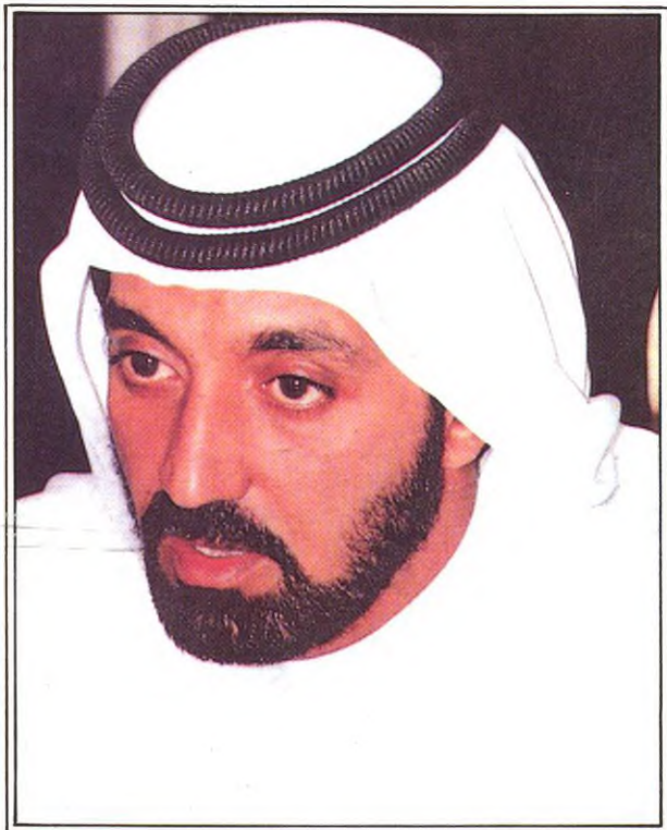
H.H. Sheikh Ahmed Bin Saeed Al Maktoum Chairman, Emirates