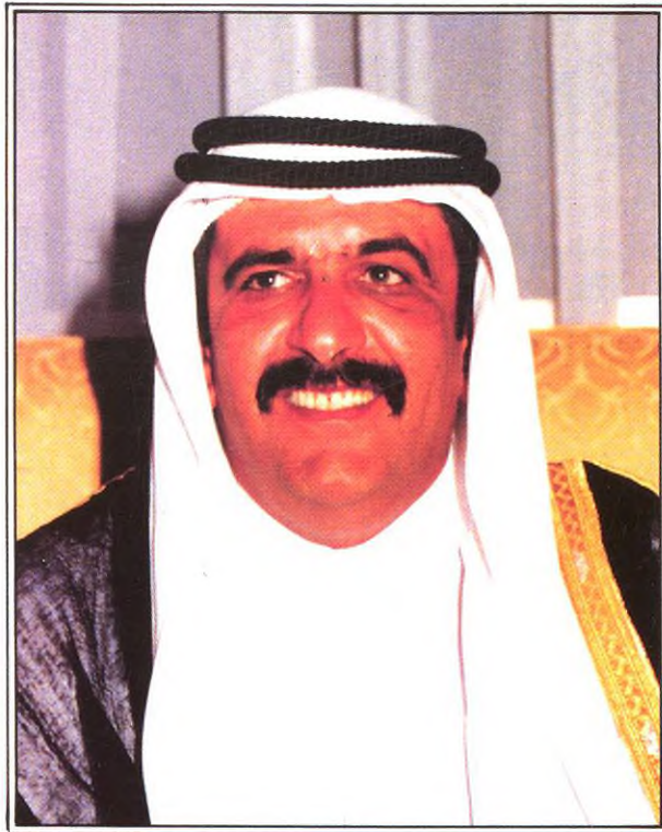
H.H. Sheikh Hamdan Bin Rashid Al Maktoum President Al Nasr

Under the auspices of H.H. Sheikh Hamdan Bin Rashid Al Maktoum