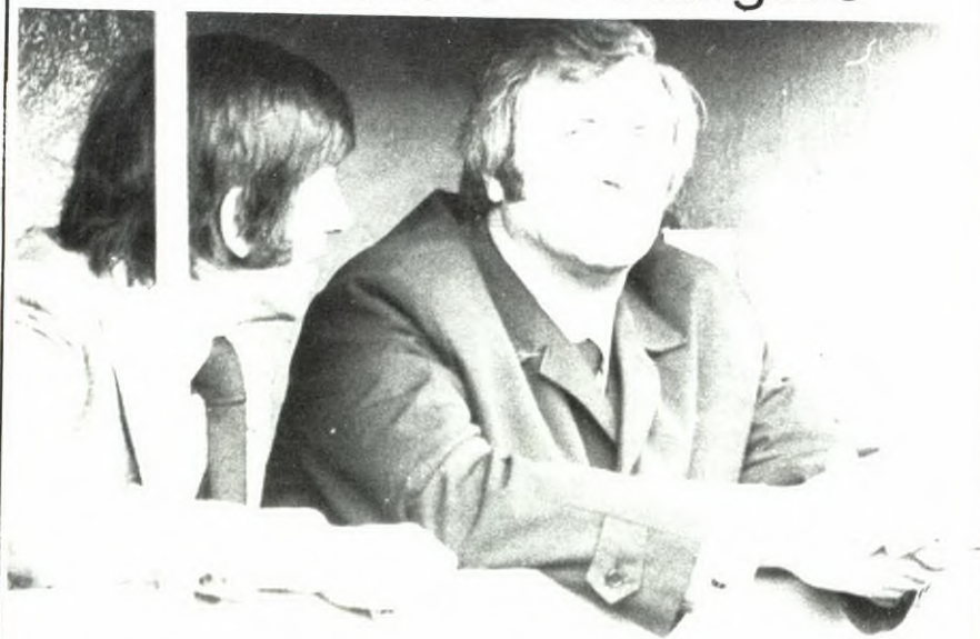
Ibrox leaders . . . team captain John Greig and manager Jock Wallace.