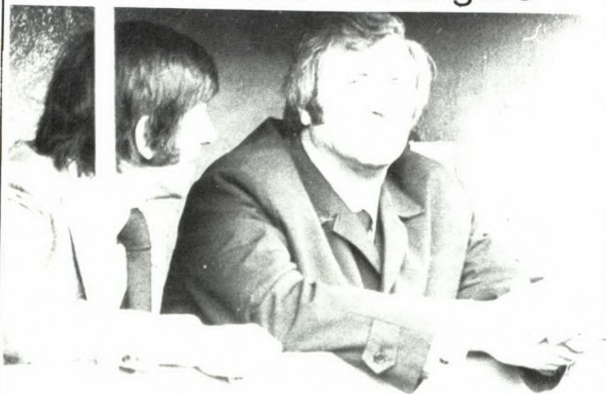
Ibrox leaders . . . team captain John Greig and manager Jock Wallace.