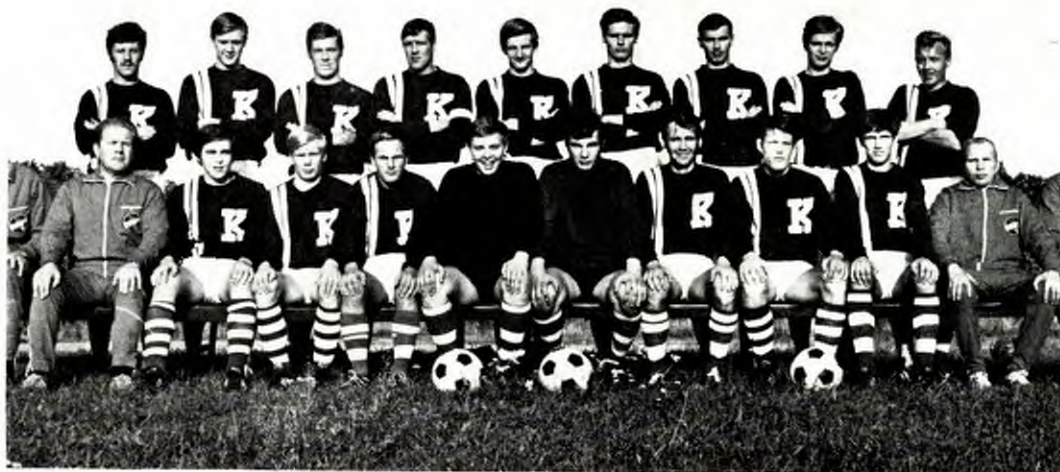
K.P.V. KOKKOLA, FINNISH CHAMPIONS, 1969-1970