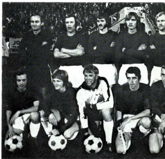
Vejle Players and Coach b