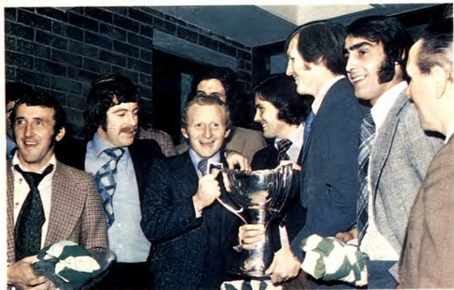
It's the last time Celtic won the Scottish League Cup after beating Hibs 6-3 in the final. Jimmy Johnstone can't conceal his joy as he holds the Cup along with Pat McCluskey and skipper Billy McNeill. Also in the picture are Danny McGrain, Dixie Deans, who scored a hat-trick, Paul Wilson and trainer Neil Mochan.