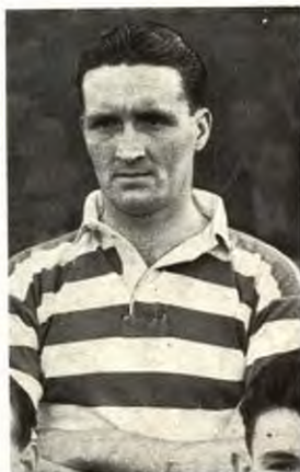
JOCK STEIN (The Celtic captain)