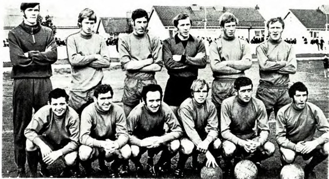
WATERFORD F.C.—EIRE LEAGUE CHAMPIONS, 1969-70