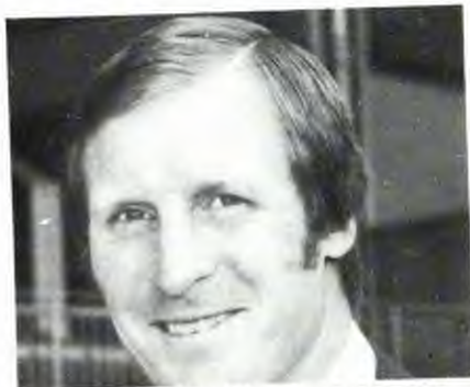
MANAGER BILLY McNEILL