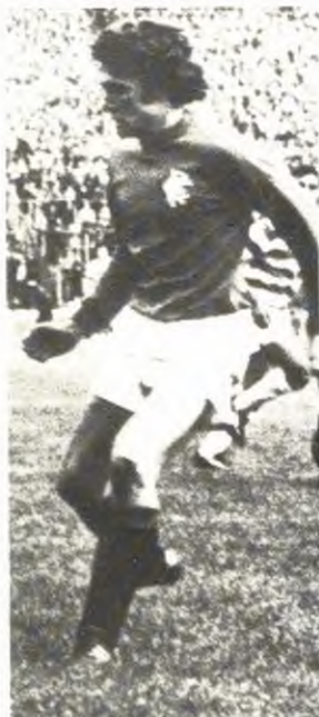
SANDY JARDINE Rangers' right-back.

GRAHAM FYFE: forward. Joined the club in 1968 and has played numerous games as an attacker. Helped Rangers to their League Championship success.